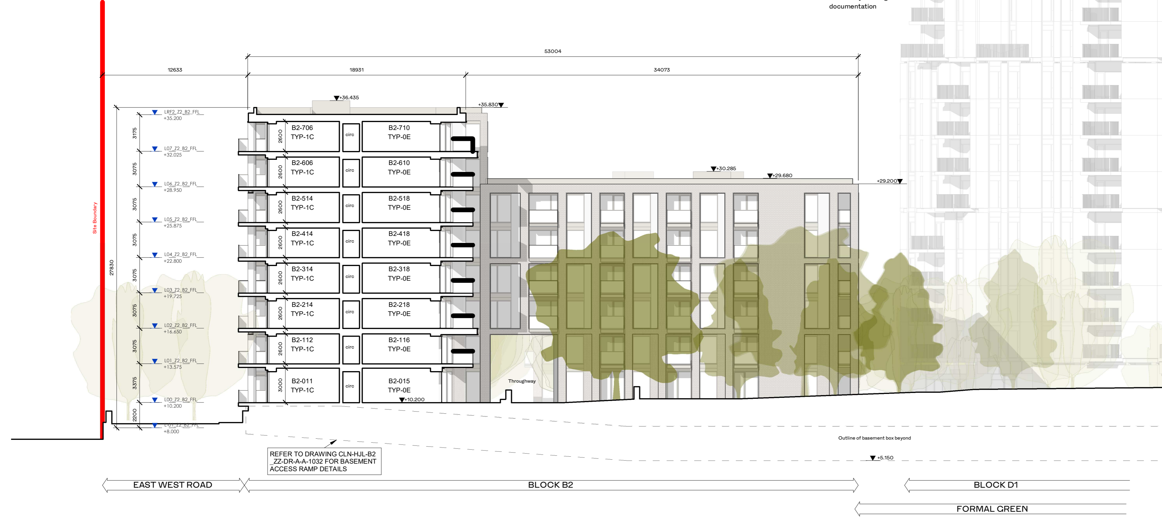
2 GA Section - Section B-B 1:200